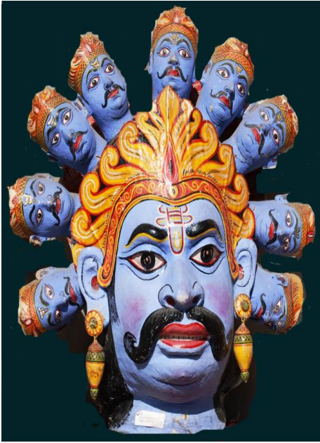
Fig. Mukh mukha of demon king Ravana

in height above the waist of the wearer. The huge structure of such a mask portrays the aura of the character portrayed .It is pertinent to note here that in comparison to the huge structure of such masks, they are very light due to the raw materials used and the intricate