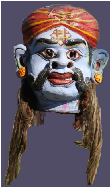
Fig: Anthropomorphic mask of Demon Khara

beings through bare faces. Masks are generally worn with a costume; sometimes such a costume is so complete that it covers the entire body of the wearer. Mask is a form of art. It is an aesthetic creation of man and it has a thought provoking history of evolution. In human society there are generally two specific features of masks. The morphological features of the mask are derived from natural forms. Masks which possess human features are known as anthropomorphic and those with animal features are known as theriomorphic. Some of the masks closely resemble real objects while some others are made on the basis of imagination. Usually masks represent demons and deities, ancestors, animals, imagined figures, etc. Among the uses of masks socio-religious, festive, theatrical, funerary and commemorative, therapeutic, etc. are very common.