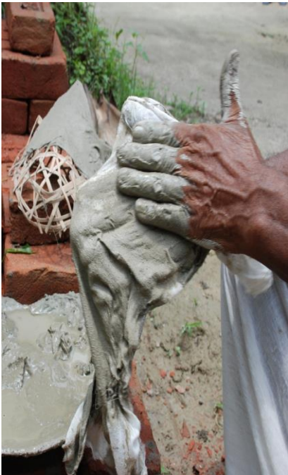
Fig: The base of the mask is covered with the mixture of cotton cloth, clay and cowdung of calf