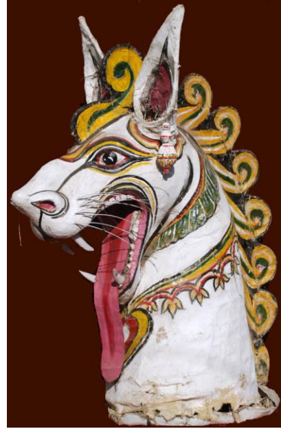
Fig: Cho mukha of Narasimha, the incarnation of lord Vishnu