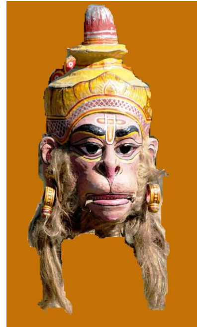
Fig: Theriomorphic mask of monkey king Sugriva

In each society there is pristine permission and prohibition integral to facial expressions. In all culture keen attention has been paid to train the members about the facial expression according to the context. Some of the facial expressions are taken as the sign of vulgarity and bad manner of a person. Moreover, an expression accepted in a particular situation like in marriage ceremony, different festivals, etc., are not accepted in a mortuary rite or in some other rituals. The facial expressions tabooed in different environments of a culture are also depicted through the masks made by the members of