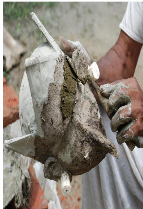
Fig: The step of chehara dia , giving the appearance of the mask