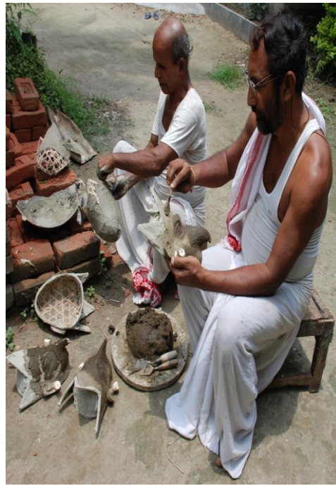
Fig: The mask makers engage in making base of the mask