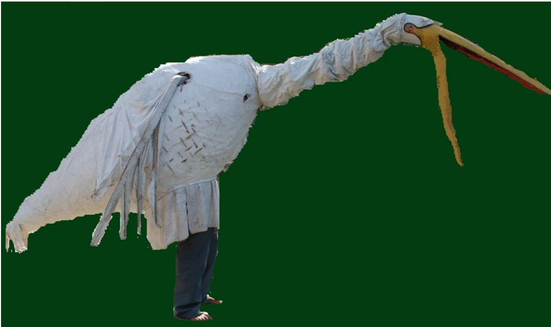
Fig: Lotokai mukha of the demon Bakasura