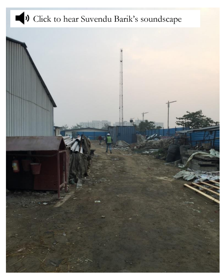
Figure 3. Suvendu Barik's image of the construction site on campus