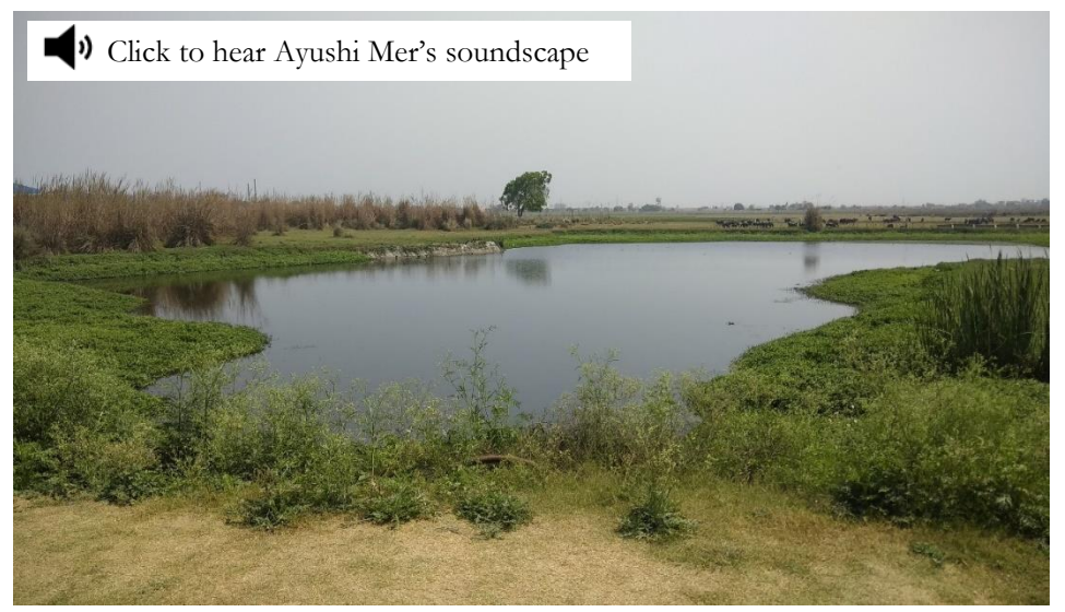
Figure 6. Ayushi Mer's image of the lake on campus.

An image that I want to cite for its accompanying soundscape is this image below (Figure 6) of Ayushi Mer – an Electrical and Electronics major student. Ayushi worked with an image of the lake on campus and her soundscape is revelatory for the detail it captures in order to work out an experiential register of walking by the lake. Her sounds move from footsteps on concrete to walking on twigs and leaves around the lake, to capturing sound of the water both of the lake and water in a pipe that is used to water the lawns around the lake to tapping